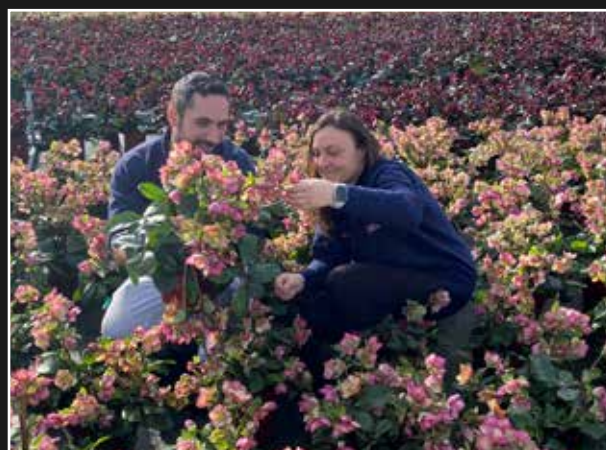
Our growers quality checking the stock.