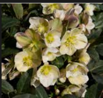
HGC® Ice Breaker® Ruby

Vigorous Early flowering November 2 and 4.5 litre burgundy pot