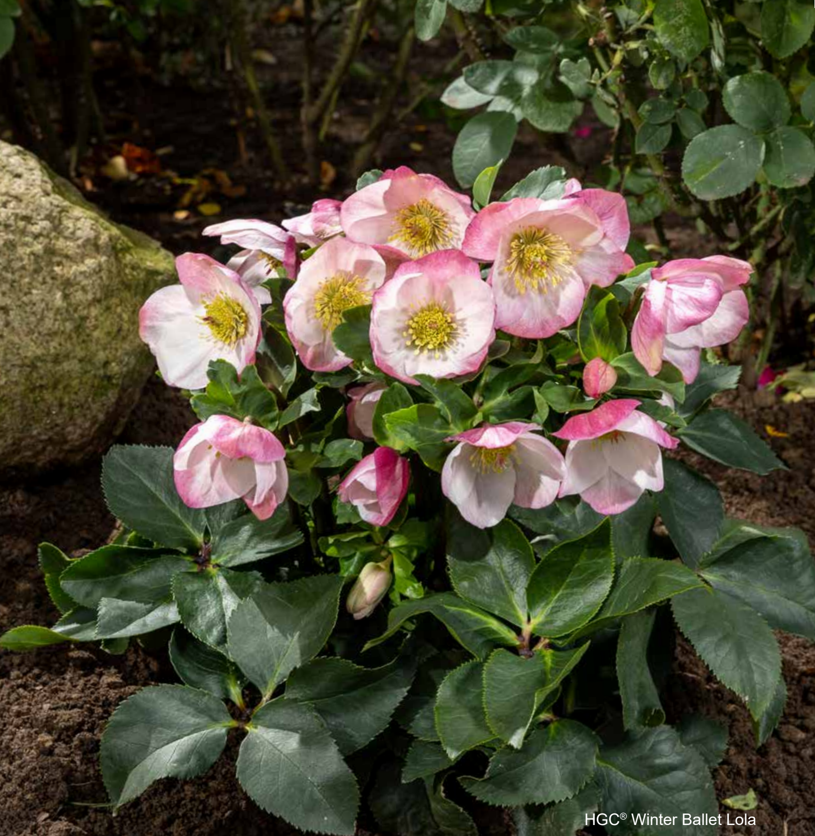
HGC® Winter Ballet Lola

We aim to offer Quality, Service and Value