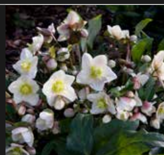
HGC® Monte Christo®

Medium vigour Early flowering November 2 and 4.5 litre burgundy pot