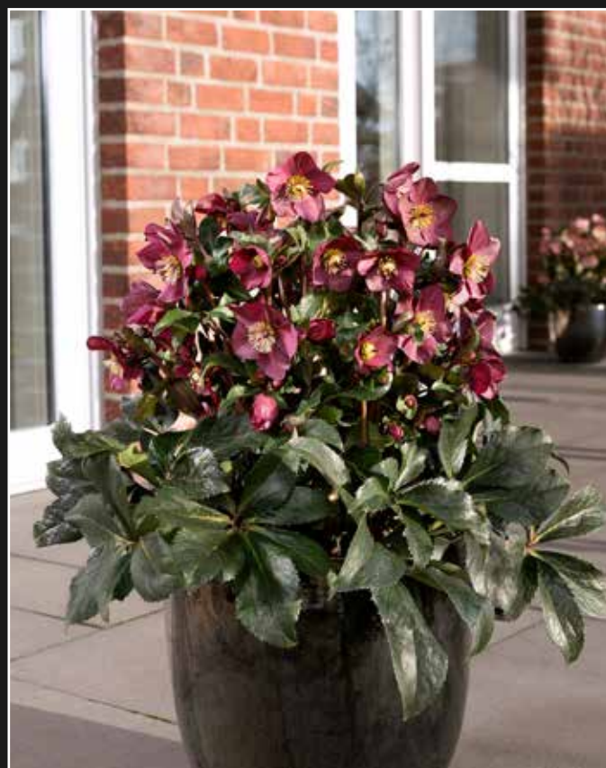
HGC® Ice N' Roses® Red