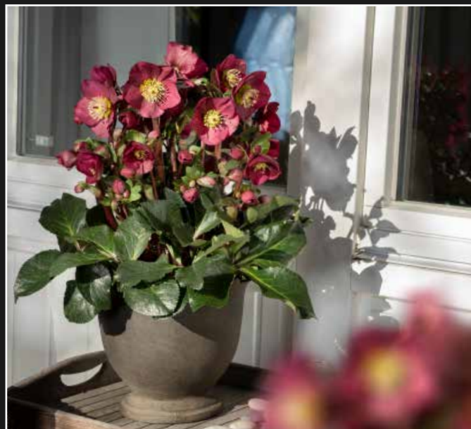
HGC® Ice N' Roses® Bennotta